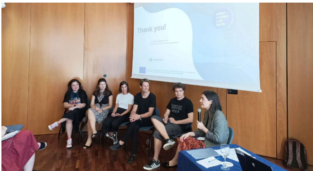
Figure 3: the panel discussion after the second session

The Living Labs also discussed the role of financial incentives to engage stakeholders. Most living labs agreed that this may not be a good idea, sharing some of the challenges that could hinder progress. For instance, acquiring sufficient funding can prove to be difficult; the final results/decisions can be negatively affected; and it fuels complicated expectations that potentially can disengage stakeholders when not met. Other living labs offered alternative pathways, such as tapping into volunteer groups, engaging with stakeholders who may be interested in the topic without financial incentives (such as citizen groups in Sligo, Ireland and officials in Oeiras, Portugal), and presenting the opportunity for stakeholder engagement on a key socially relevant issue as the 'advantage' itself.