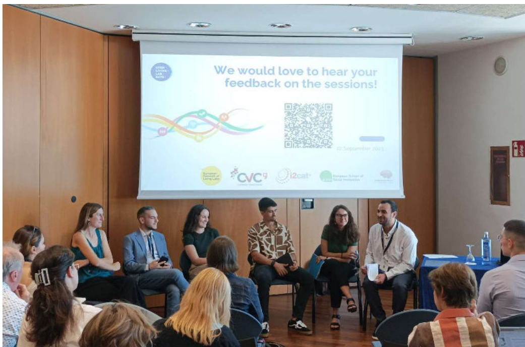
Figure 2: The panel discussion after the first session of the international workshop.

The participants also believed that the systematic approach and feedback loops, as well as the innovation and collaboration aspects, would be missed if Living Lab elements were removed from the project. These elements include observing concrete results from interactions, utilizing questionnaires, and filling forms with citizens and industry regarding their needs in order to ask for funding from their government. Additionally, citizen science activities, such as the analysis of images and data submitted by individuals, were subsequently analyzed.